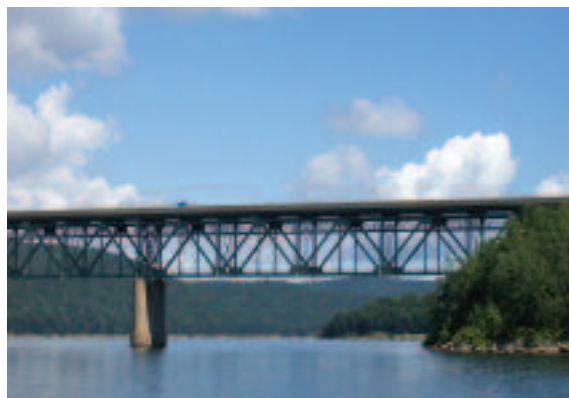
MORRISON BRIDGE: Allegheny wilderness and manmade accomplishments complement each other with breathtaking beauty.

The mission of the PKP is to attract visitors to the area surrounding the Allegheny Reservoir, educate them about the rich history of its past, provide facilities to enjoy the present, and enhance