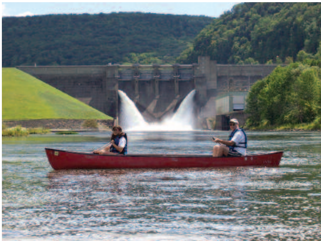
REVITALIZATION PLANNED: A canoe just below the Kinzua Dam, established in 1965, highlights recreational possibilities on the Allegheny River. The PKP project will help bring this area into the future with revitalization of existing sports and facilities.

Last fall, the Community Foundation of Warren County announced it would present a one-time grant of $10,000 to a selected applicant to celebrate the foundation's 60th year in existence. The check for $10,000 was awarded to PKP. There were 22 applicants, which were narrowed down to just 10 organizations that were posted on the foundation's website. The public then voted for the winner. Building (continues on page 14d)