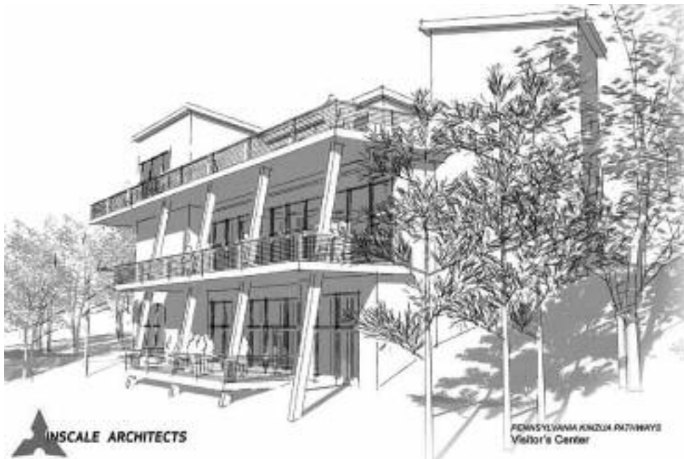
NEW KINZUA POINT: Inscale PC, a Warren architect firm, generously donated conceptual drawings for this project, including this design of the new Kinzua Point center.

wilderness access and stewardship for the future. The organization plans to enhance the area and promote it as a destination in order to generate interest in the area's resources, history and sites, as