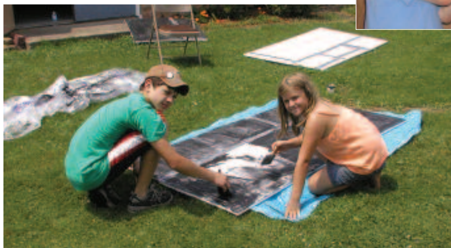
WELL-ROUNDED EXPERIENCE: The Youngsville Children's Theater offers children experience in acting, as well as working with costumes, props and stage backdrops.