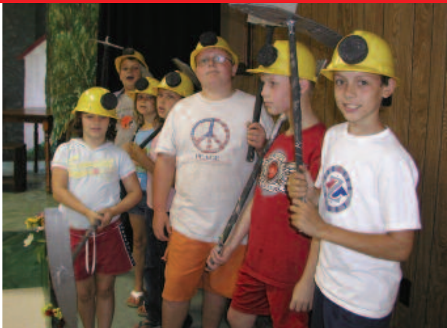
LOOKING BACK: Cast members of the 2009 production of 'Snow White' say 'Hi-ho, hi-ho, it's off to work we go.'

theater during the 21 hours of instruction (each day starts at noon and ends at 3 p.m.). It is not just the knowledge of acting that the children receive; they also learn about lighting, sound, props, costumes, makeup, hair, sets and backstage work during the camp. Many children find that acting is not for them, but they love working on the stage effects.