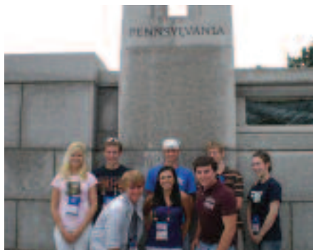
HISTORIC SITES: The Youth Tour itinerary includes visits to monuments, museums and the National Zoo.