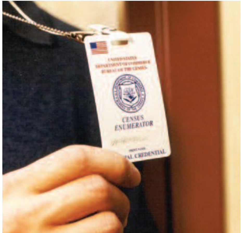
U.S. CENSUS BUREAU

Research was conducted to complete the 2010 Census by internet. The study proved that it did not save money, it did not increase the percentage of people responding or protect individual responses. Tests are still being done to provide a more secure inter-